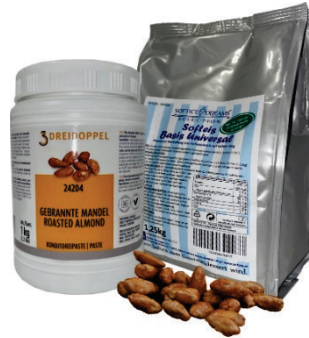
Mandorla tostata Kit