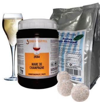
Marc de Champagne Kit

SOFTICE DREAMS® 3 DREIDOPPEL SofticecreamKits: