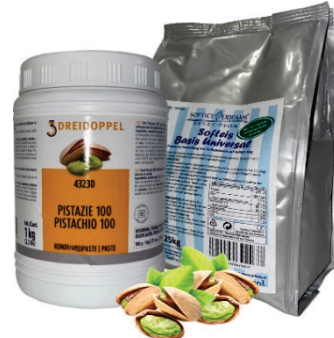
Exclusive Pistachio Kit

With these new flavours, you can present your customers a range innovative soft ice cream creations at the very highest level of quality and taste.